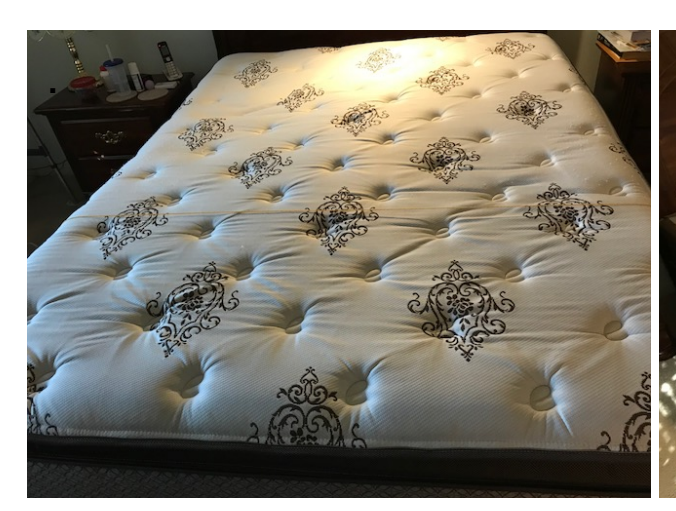
Show a picture of the whole mattress or set without bedding