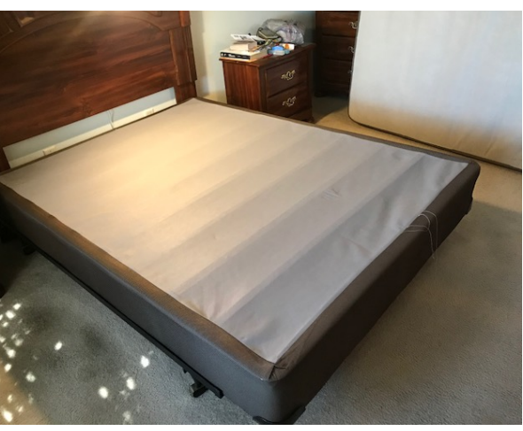
Show a picture of the foundation (or bed) underneath the mattress