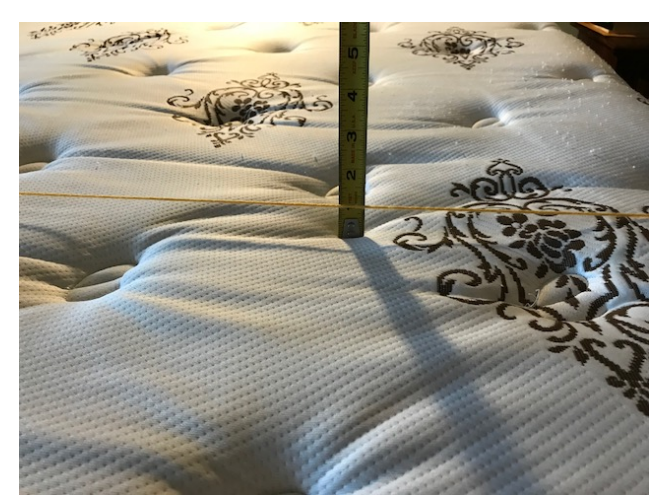
Showing the defect. If an impression, with a straight edge across the mattress, measure down showing the depth of the impression